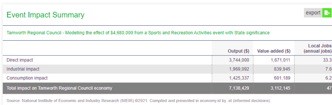
Figure 1: Event Economic Contribution

Futurity is 15 days of action-packed competition, encompasses over 6,000 head of cattle and 700 competitors from Australia and overseas. NCHA’s relationship with Tamworth is well established. From the original days of planning AELEC, NCHA have contributed their knowledge and continue to support the growth of the equine industry across the region. NCHA are eager to grow the Futurity event expanding on its current offering.