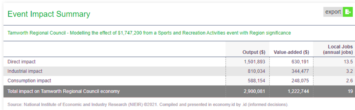
Figure 2: Event Economic Contribution

The proposed Nutrien Graduate Campdraft event is planned to start on September 1st, 2023 and to run for 4 days. It is an event of Region significance and is estimated to attract 2800 visitors per day over the 4 days, with an average spend per person per day of $156. This equals a total visitor spend of $1,747,200 attributed to this event. Assuming the event will be held in Tamworth Regional Council, it is calculated to have the following potential impact: