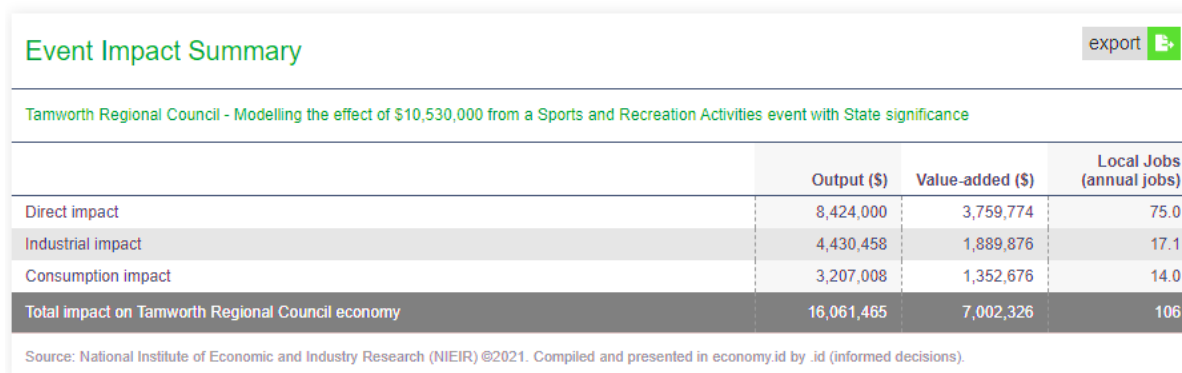
Figure 1: Event Economic Contribution

The proposed Nutrien Classic event is planned to start on July 1st, 2023 and to run for 15 days. It is an event of State significance and is estimated to attract 4500 visitors per day over the 15 days, with an average spend per person per day of $156. This equals a total visitor spend of $10,530,000 attributed to this event. Assuming the event will be held in Tamworth Regional Council, it is calculated to have the following potential impact: